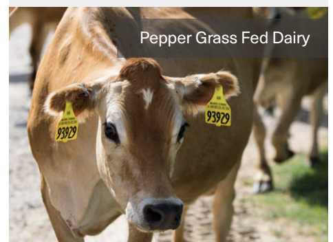
Pepper Grass Fed Dairy